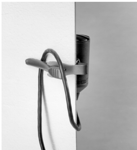
CABLE ANCHORING FIGURE 4

Insert the SM11 in the tie clasp and anchor the cable as shown in Figure 4. Affix the clasp to a tie, shirt, or blouse. Note that the microphone can be swiveled 360° in its holder for left, right, or vertical ("pen clip") use.