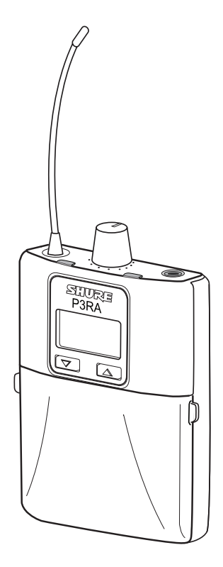
P3RA Premium Wireless Bodypack Receiver