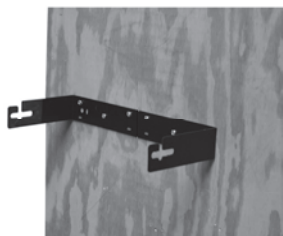
(1) Fix the brackets to the wall

This mounting system can be used for vertical, horizontal or ceiling mounting. If safety rules allow, it is possible to mount the MASK8 vertically with one bracket only fig.A However in that case we strongly recomend to use a extra safety cable.