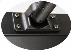
Bel Canto C1 wall bracket