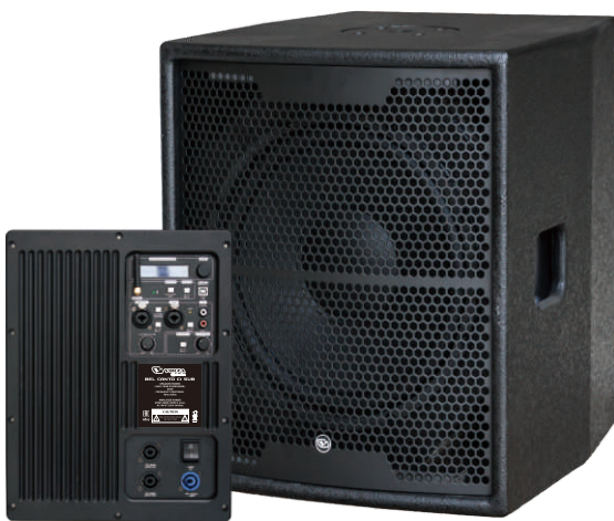
Bel Canto C1 SUB