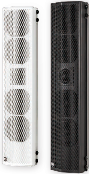
Bel Canto C1